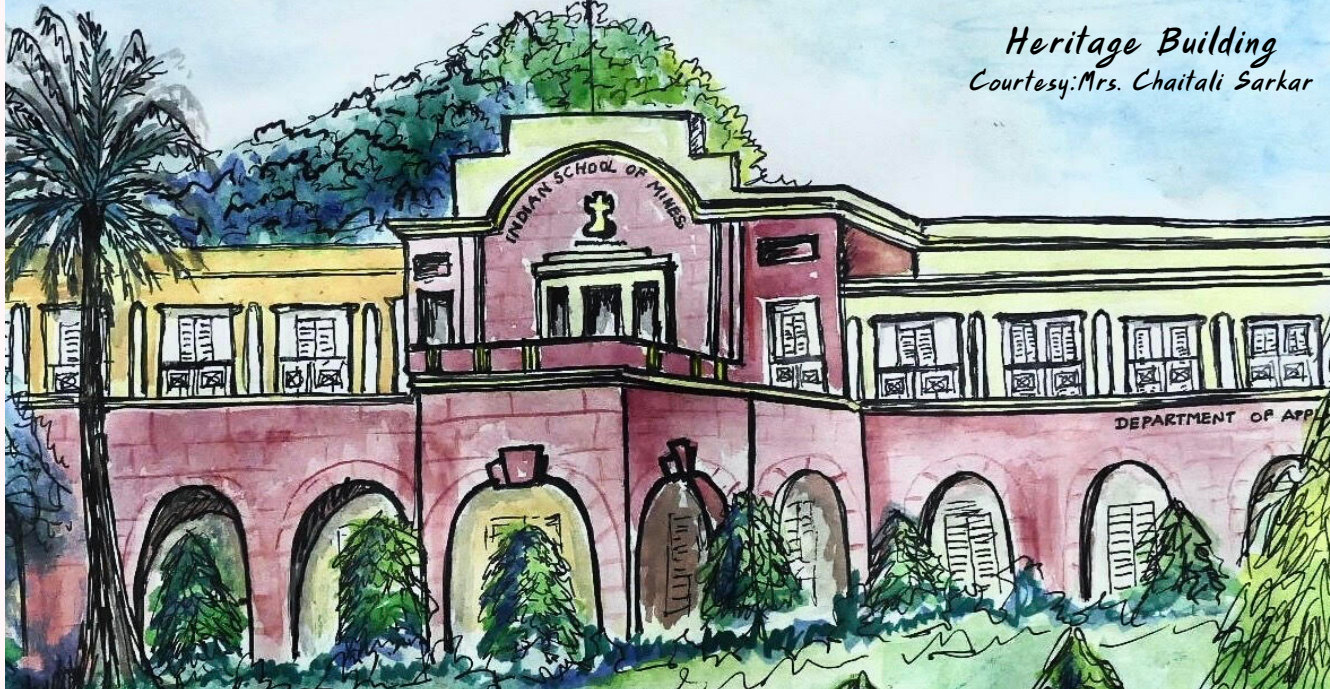
Heritage Building

OVERALL RANKING- 22 ENGINEERING-12 MANAGEMENT-29