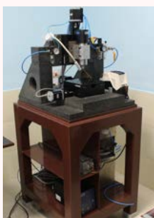
IMAGE OF MICRO MACHINING DEVICE